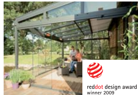
▼ The Glasoase® from the weinor world of terraces

Worth & Co Blinds Ltd R/O 26-30 Christchurch Rd Southend on Sea Essex SS2 4JS Tel: 01702 467581 E-mail; sales@worthblinds.com www.worthblinds.com