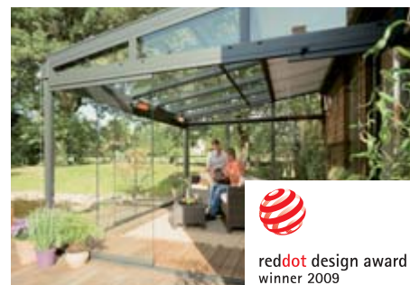
▼ The Glasoase® from the weinor world of terraces