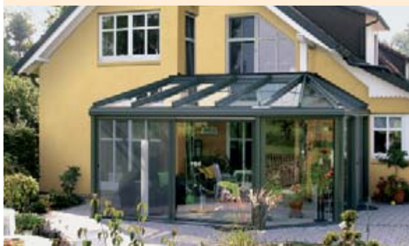
▲ weinor conservatories

No matter what you want to use your patio for, weinor has the right product for you – awning, patio roof, Glasoase® and conservatory