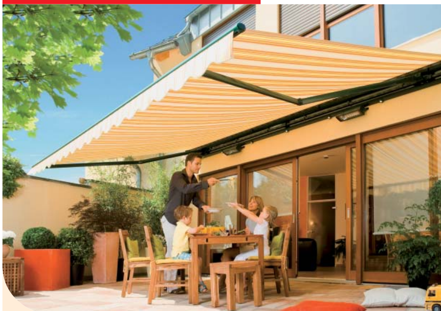
▲ weinor awnings